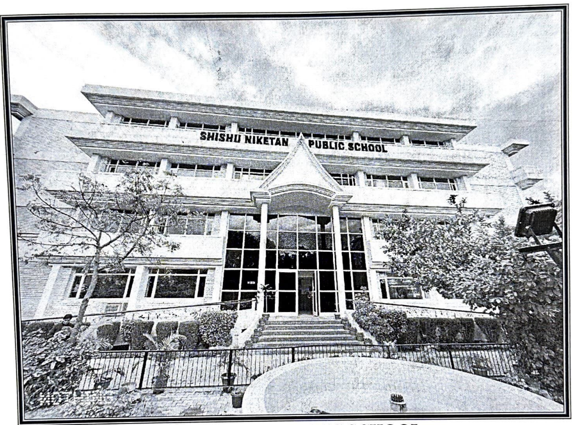
SHISHU NIKETAN PUBLIC SCHOOL

BLOCKS: A SENIOR WING (CONSTRUCTED WITH BASEMENT + 4 STORIED)